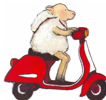
Il regalo / by S. Van Ommen

Access is free up to 1 hour per time and up to 3 hours per week. For underage subscription, it is necessary to have the parents' or tutors' authorisation.